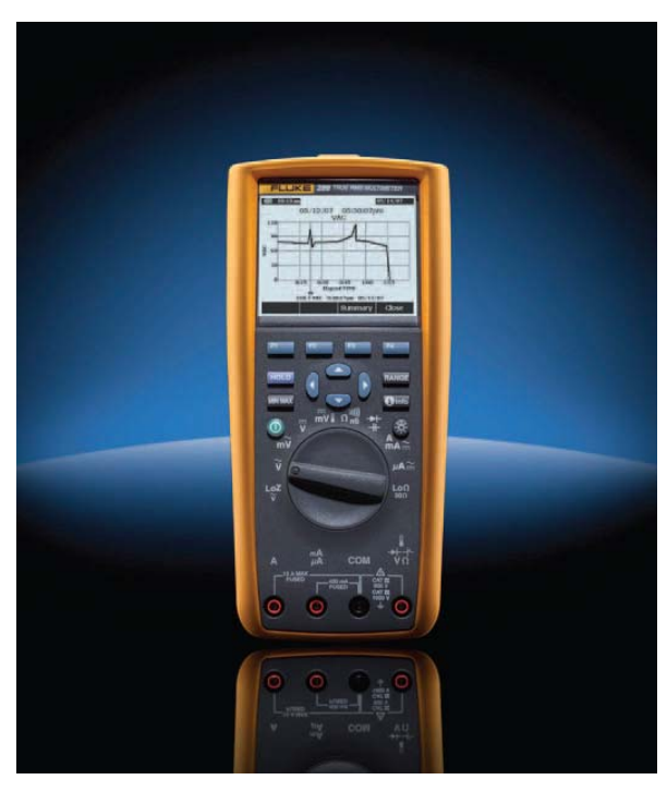
Fluke 289 True-rms Industrial Logging Multimeter.

Once you correct any abnormalities found during the visual inspection, take voltage measurements to ensure there is no electromagnetic interference from power conductors. Use a properly rated digital multimeter to measure and record voltage levels. Input voltage to electronic equipment such as PLCs and VFDs is generally specified as plus or minus 10 % of the rated voltage. Measure voltage to each input and output field device. Be especially wary if any significant voltage is present where it should be absent. This may be an indication of induction from power conductors, creating low control circuit voltages. Quite often the source of this problem is in the field routing of conductors and can require considerable troubleshooting to locate the problem. Since the voltage induced into the control circuit wiring will vary as the current flow varies through the power conductor, control circuit voltage necessary to use a recording digital multimeter, such as the Fluke 289 True-rms Industrial Logging Multimeter, to identify these variances.